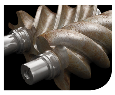
Rotors with conventional lubricant

Synthetic lubricants are better for the environment, last longer, are less expensive and are less prone to contamination and varnishing. Our family of synthetic lubricants are specifically designed to help rotary screw compressors maintain peak performance.